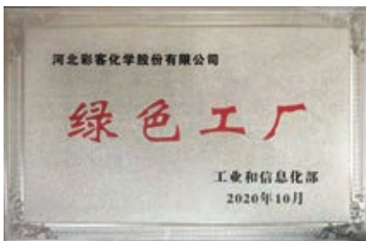
Green Plant (綠色工廠)

Environmental and Socially Responsible Enterprise in 2020 2020年度環境社會責任企業