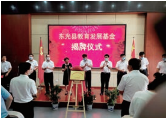
Establish “Dongguang Educational Fund”

此外，本集團亦支持社區教育，出資500萬元人民幣成立「東光縣教育基金」。本集團於本報告期內已撥款300萬，在未來年度將每年撥款50萬，直至500萬元整。基金目的是為了改善辦學條件，助教助學，對教育事業奉獻一分力量。在其他方面，彩客化學也盡其綿力，如組織公司員工獻血和職工互助等關心員工、貢獻社區的活動。