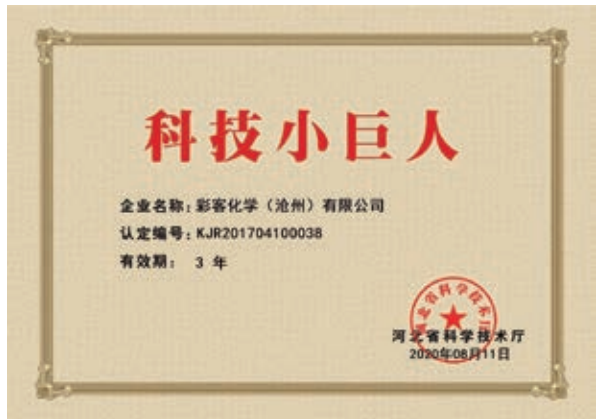
Science and Technology Small Giant (科技小巨人)