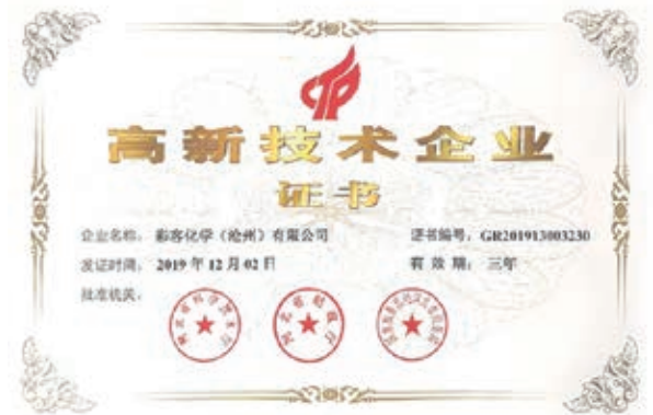
High-tech Enterprise (高新技術企業證書)