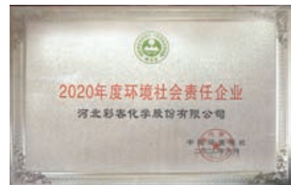
Environmental and Socially Responsible Enterprise in 2020 (2020年度環境社會責任企業)