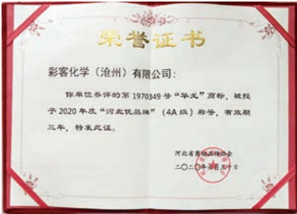
Quality Brand in Hebei (河北優品牌)