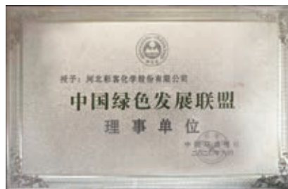
China Green Development Union Unit (中國綠色發展聯盟理事單位)